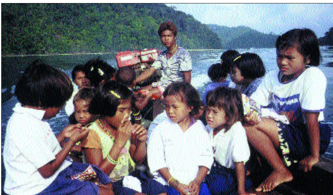
Moken children, some in school uniforms, take a boat shuttle to the small school on North Surin