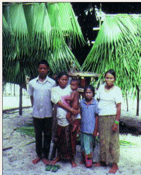
A Moken family in front of their hut.

A major problem among the Moken is substance abuse. Suraswadee School has started a campaign against drug addiction involving the youths, but adult education is important as well. The Park Authority should have access to educational videos and posters explaining the deadly effect of substance abuse. NGOs may be able to provide assistance. The Park Authority should seek help from the Narcotics Control Unit and exert restrictions over fishing vessels, as they are blamed for trafficking drugs in the area.