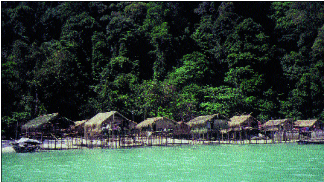
A Moken village on South Surin Island.

The park covers an area of approximately 135 km 2 , of which 76 per cent is sea, and compris-