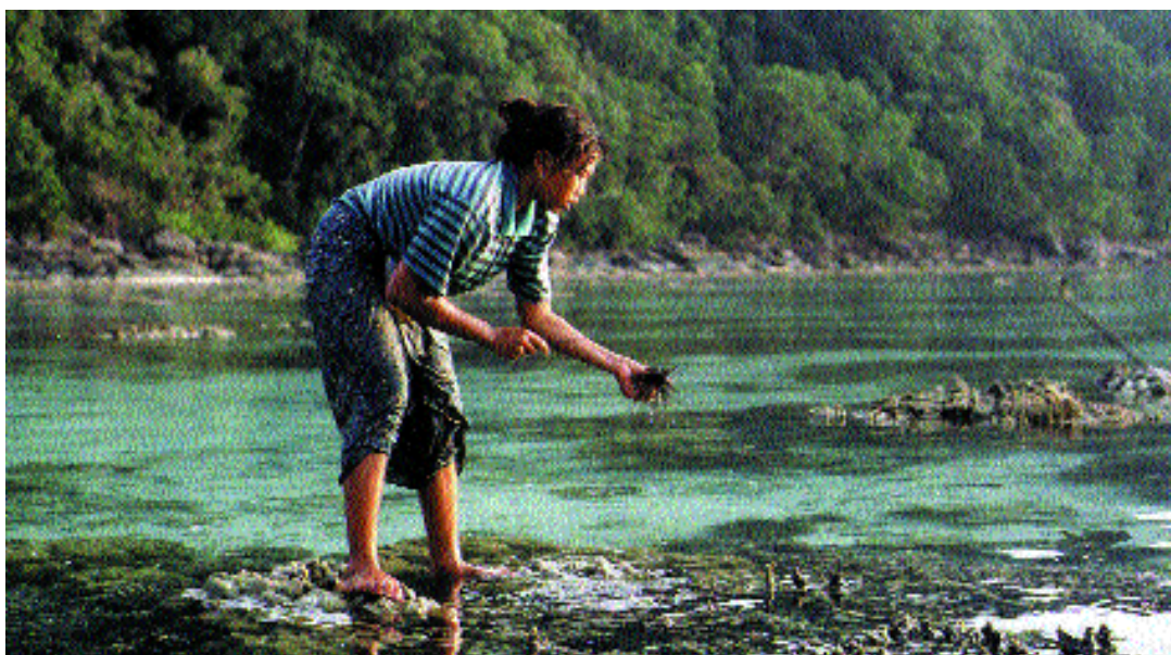
A Moken woman gathers sea urchins on the reef flats.

Despite the Moken's use of the islands' natural resources, there are no obvious signs of severe over-exploitation. Damage to the ecosystems around the Surin Islands is mainly the result of illegal fishing activities by the semi-industrial Thai fishing fleets and reef damage resulting from the anchoring of pleasure boats. No dynamite fishing or cyanide fishing is evident in the waters around the Surin Islands. In fact, the Moken are not considered true fishers, since they mainly extract resources from the reef and mud-flats by gathering, rather than fishing.