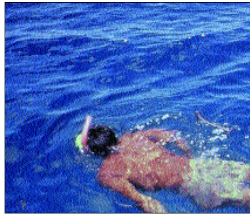
A Moken man earns a livelihood by diving for fish, shellfish and other marine animals.

With the support of UNESCO, the Marine Parks Division of the Royal Thai Forest Department is teaming up with anthropologists from Chulalongkorn University to explore ways in which the Moken, with their indigenous knowl-