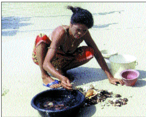
A woman cleaning seashells for sale to tourists. This picture was taken in 1994 before the park authorities enforced a ban on the collection and sale of shells on the islands in 1997.

With the declaration of the Surin Islands as a national park in 1981, restrictions on the fishing and foraging activities of the Moken were imposed. Despite national park status, the Moken continue to live off the resources found on the land and in the sea. The extraction of natural resources by the Moken is not without environmental impact. Their gathering patches are somewhat over-exploited since they have adopted a more sedentary lifestyle. Due to the high