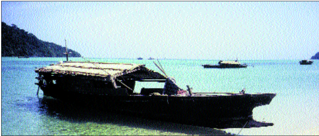
The Moken spend almost half of their life in a 'Kabang', the traditional boat of the Moken. Wooden planks have replaced the Zalacca wood as the preferred material of the gunwale. A bifurcated bow and stern is a distinctive characteristic of the Moken boat.

es five islands (see map on inside front cover). A few kilometres to the north of the park is the border with Myanmar, and about 100 km to the south are the Similan Islands, another marine national park.