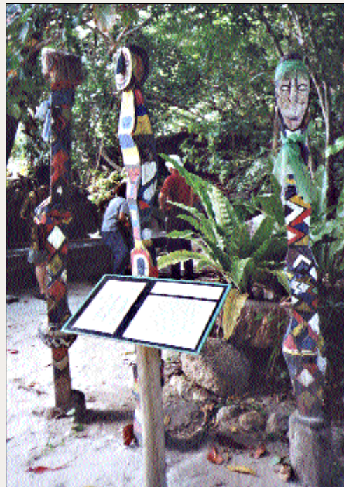
Moken totem poles at park headquarters.