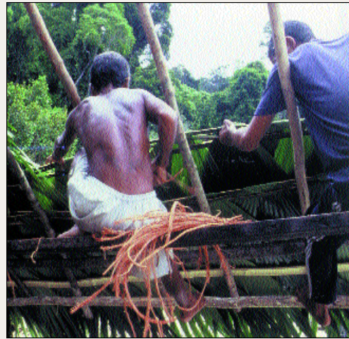
Moken men thatch their roof with palm leaves.

The Park Authority should also coordinate with the Tourism Authority of Thailand and the Association of Hotels and Tourism to draft guidelines for tourism management in 'special areas' such as national parks. In addition, tourism in national parks should offer basic services and simple facilities in order to avoid exploitation by developers. Furthermore, there should be a serious campaign to discourage tourists buying prod-