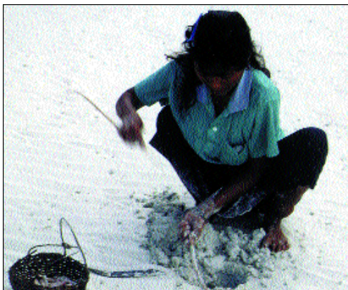
Moken woman gathers sand worms on sandy beach at low tide.

Throughout the Asia-Pacific region, it has been recognized that local people must be involved in the development of conservation regulations and be party to their implementation if the regulations are to be successfully enforced. This also implies that there must be recognizable benefits for the local population that offset the constraints imposed by regulations. For the Moken of the Surin Islands, their continued presence and use of natural resources within the park area will be facilitated by receiving and accepting their shared responsibility for safeguarding heritage values, so that together with local authorities and government department, they can explore sustainable development opportunities.