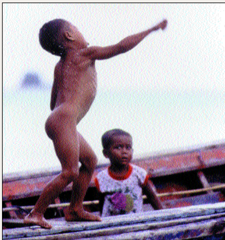
Moken boys spend much of their time playing, swimming and diving. This is a way of learning about the marine environment and building skills crucial to their daily subsistence.

The problem of the Moken violating national park regulations is a difficult one to resolve. When should park regulations be strictly enforced and in what cases may certain levels of tolerance be appropriate? To what extent should the Park Authority apply disciplinary measures on a non-literate indigenous population? Moreover, what measures can be adopted to prevent the reoccurrence of these problems?