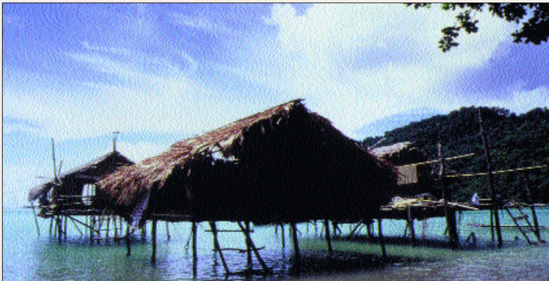
The village does not represent a permanent settlement. The Moken tend to move their village whenever grave illnesses and death strike. Mobility is also a social mechanism in coping with conflicts. Thus, this pattern of semi-permanent settlement should be encouraged instead of suppressed.

epidemics, alleviate disputes or in response to a bad omen. Periodic movement is significant for former nomadic groups like the Moken and it facilitates local ecological recovery as foraging patches are allowed to revive. During the past ten years, the Moken have shifted their settlements to five different beaches on Ko Surin Nua and Ko Surin Tai.