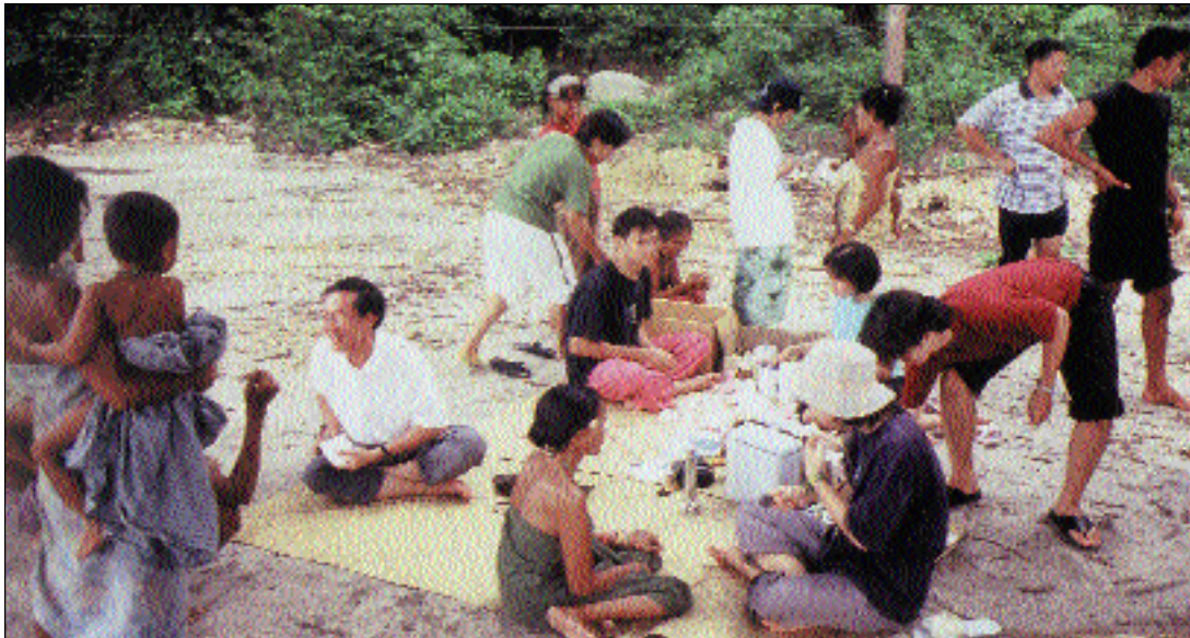
Volunteer health practitioners examine the physical health of the Moken and provide urgent medical services.