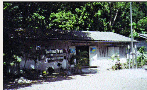
Fisheries building at Sai Ane Bay used as the school for the Moken children.