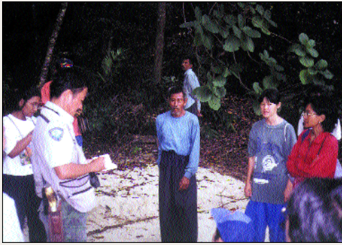
Using intimate knowledge of both marine and forest resources, the Moken have a potential to take tourists out on hiking trails for ecological tourism.

There are other problems affecting the community which cannot easily be solved, for example, population pressures stemming from the migration of Moken groups from Myanmar. Because the Moken are a semi-nomadic people, they often travel across national boundaries and occasionally settle down in another country's territory. However, if too many groups settle in the Surin Islands, this may seriously disrupt the islands' delicate ecological balance.