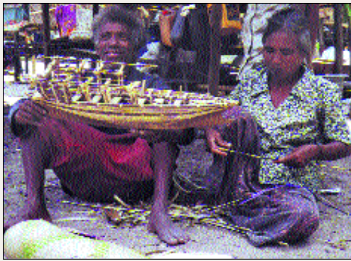
Selling model boat and mats at Moken village.